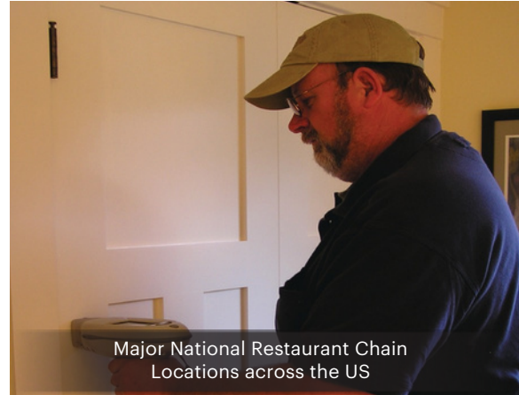
Major National Restaurant Chain Locations across the US